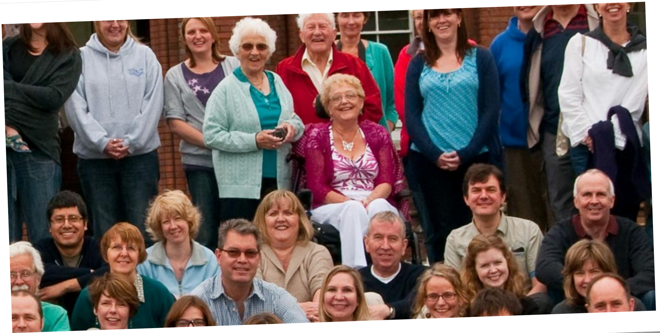
Away weekend House Party